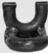
Rough Cut Stud

U-Form studs are welded on the flat (square) side of the link remaining upright for better wear and superior traction. These studs do not lay down like traditional studded chains, improving traction over rock, frozen/wet wood, ice or ledge. Standard studs are formed wire with finished ends.